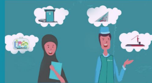
Wahid ma bilag - Hausa wa Barno ma bilag